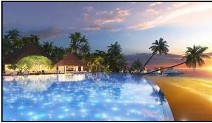
My dream Island